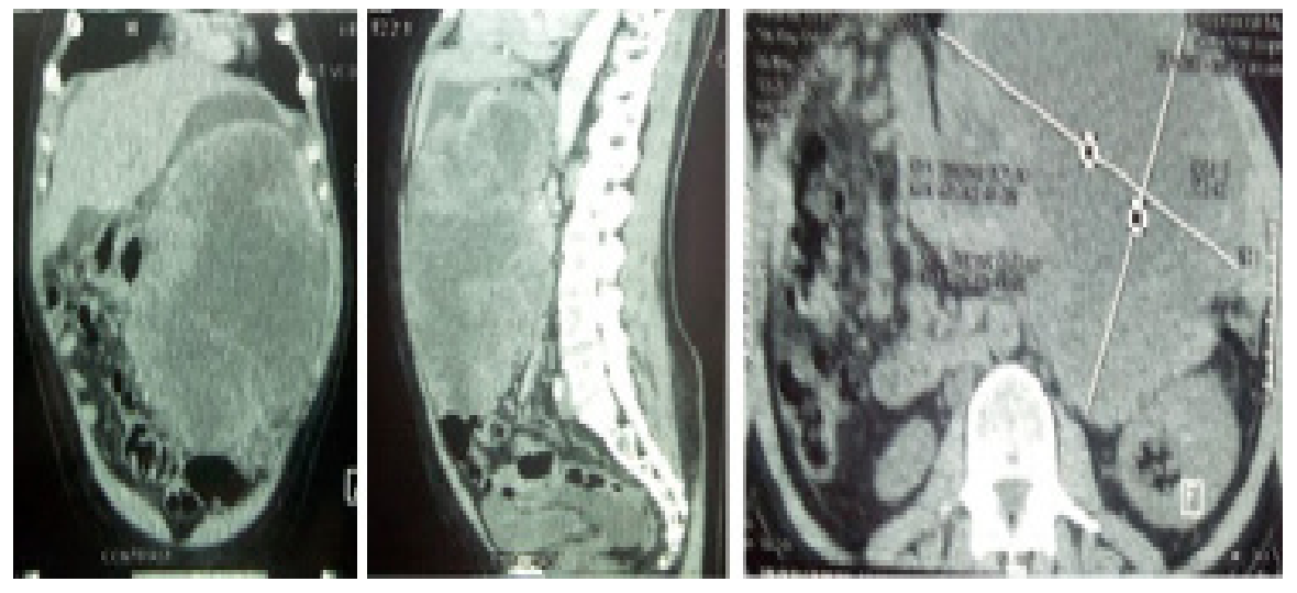
Figure 1: Contrast enhanced coronal, sagittal and axial CT images showing a giant tumour in the abdomen.

A 72 year old male was referred to Uganda Martyrs hospital, Lubaga, by his local doctor with a chief complaint of abdominal pain for 10 months. The pain was associated with early satiety and weight loss. On physical exam, there was gross distension of his abdomen with a hard, non-tender mass in the left upper quadrant. Laboratory results showed moderate anemia (Hb 10.1g/dl). Liver and renal function tests were normal. Abdominal ultrasound showed an ill-defined echo complex mass in the left abdominal quadrant most likely of splenic origin.