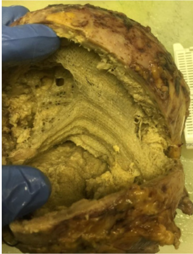
Figure 3: Textiloma

Manuscript Information: Received: December 03, 2018; Accepted: February 05, 2019; Published: February 28, 2019