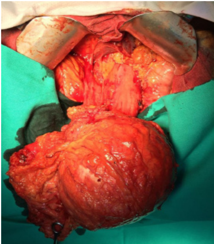
Figure 2: Large mass in the anterior face of the greater curvature of the stomach.