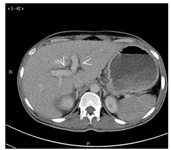
Figure 1: CT demonstrates periportal edema (arrowheads) suggestive of early pancreatitis in patient 1