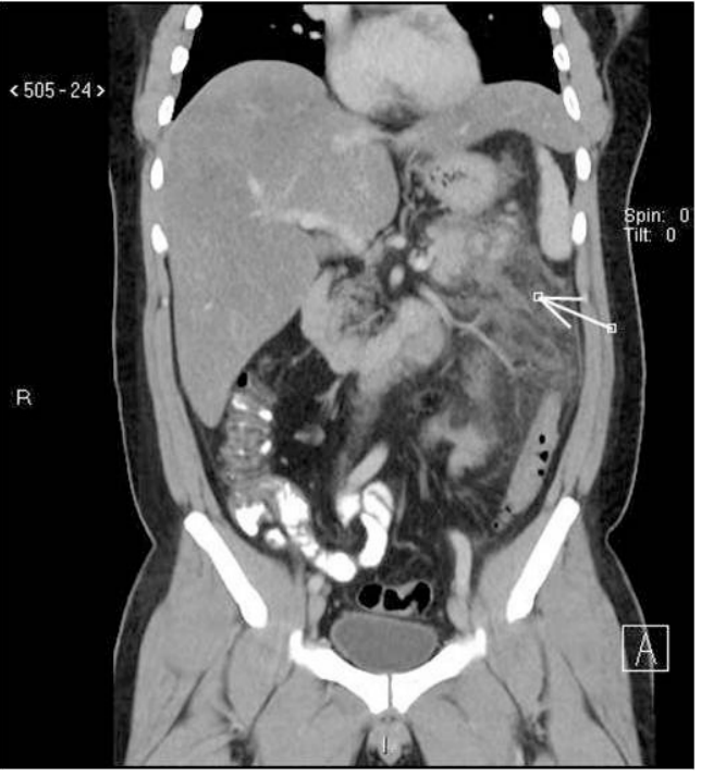
Figure 2: CT (Coronal Section) demonstrates pancreatitis (arrow) in Patient 2