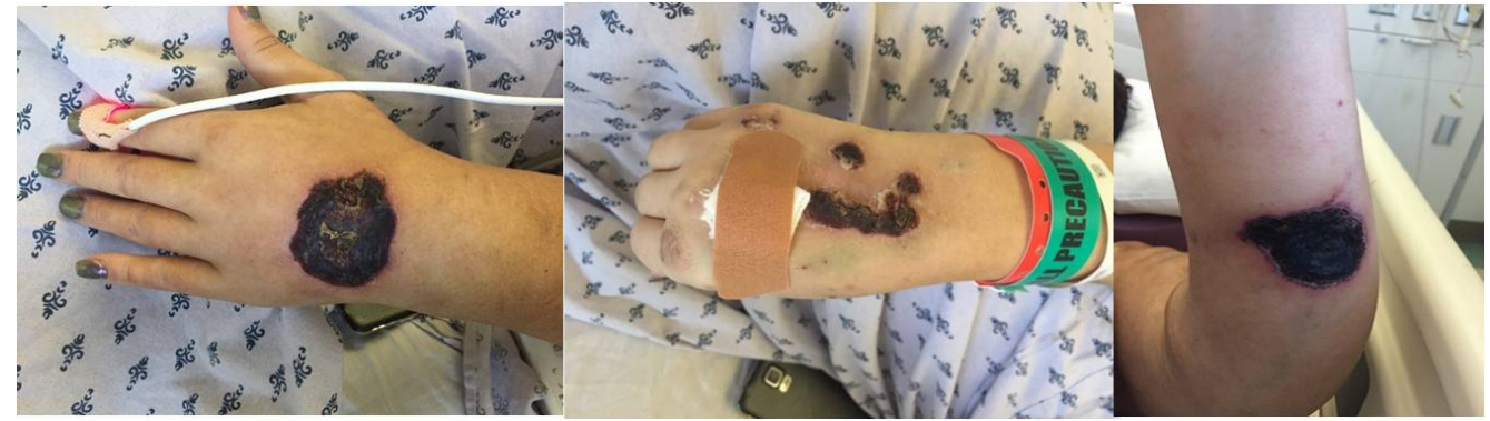
Figure 1: (A)-(C) Examination of her upper extremities show finely demarcated 2 to 7 cm circular skin ulcerations with central necrotic tissue that have developed eschars.