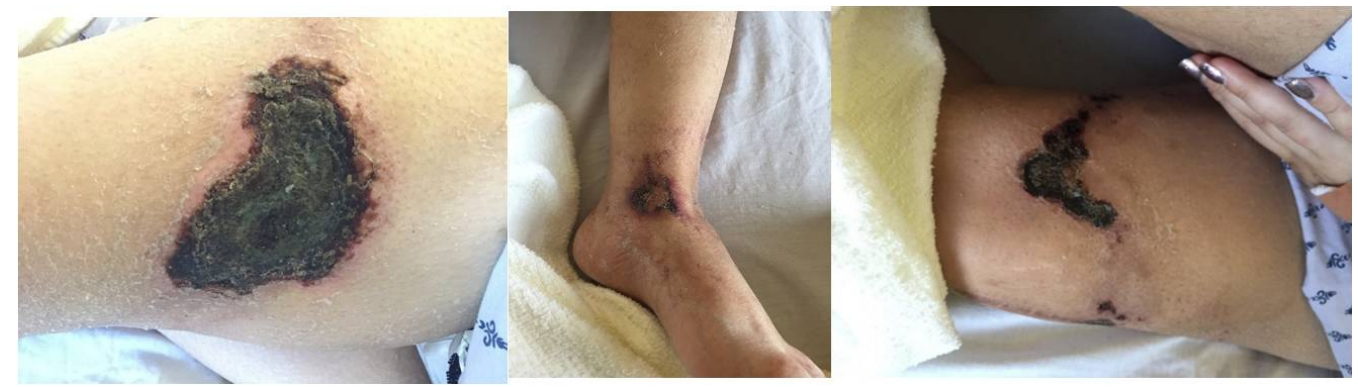
Figure 2: (A)-(C) Examination of her lower extremities show a similar pattern to her upper extremities with finely demarcated circular ulcerations with central necrotic tissue that have developed eschars.