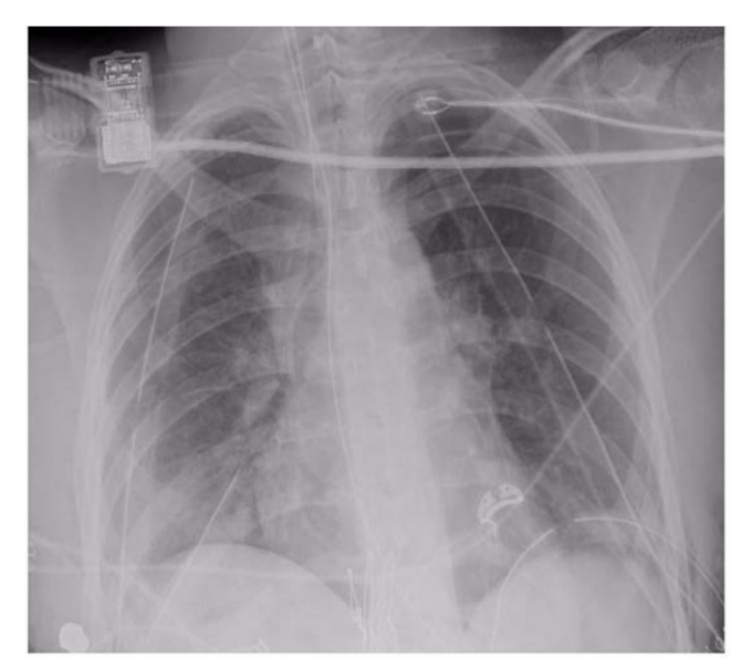
Figure 2: Post Op Index Surgery Chest radiography