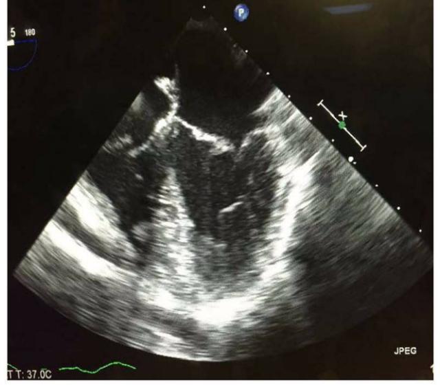
Figure 3: TEE showing right ventricular wall post repair