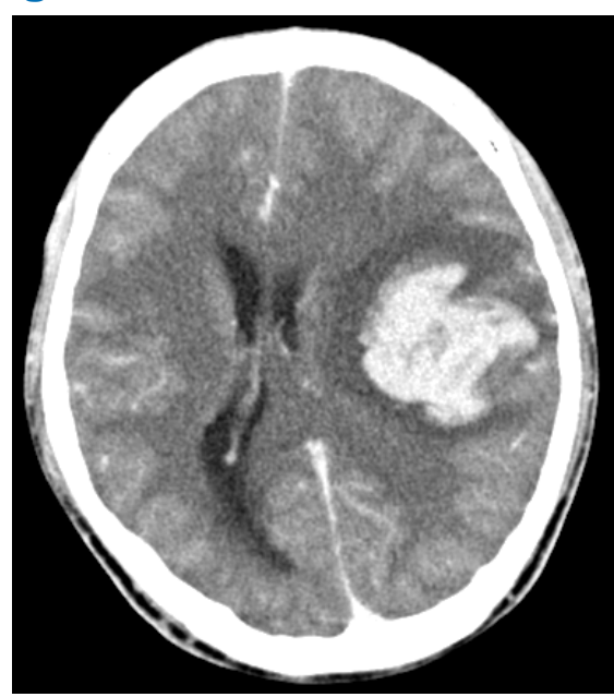
Figure 1: Brain CT revealed intracerebral hemorrhage (4.8x*4.8*3.7cm) in left parietal area with midline shift