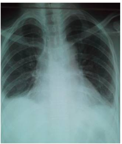
Figure 4: Chest X- ray showing reduction of lung volumes and mild effusion in the right lung-associated an episode of pulmonary emboli.