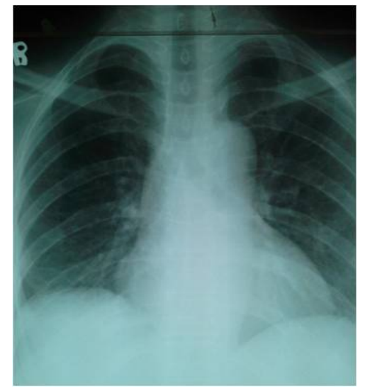
Figure 3: Chest X-ray showing reduction of lung volumes over one and half years' time with mild bilateral basal atelectasis