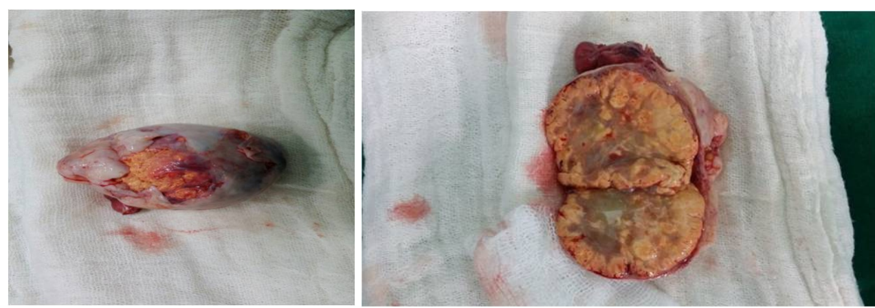
Figure 1 & 2: A photograph of gross and cut section of the patient's right ovary demonstrating a Leydig cell tumor measuring 4.5*3.5*3 cm with no hemorrhage and necrosis.