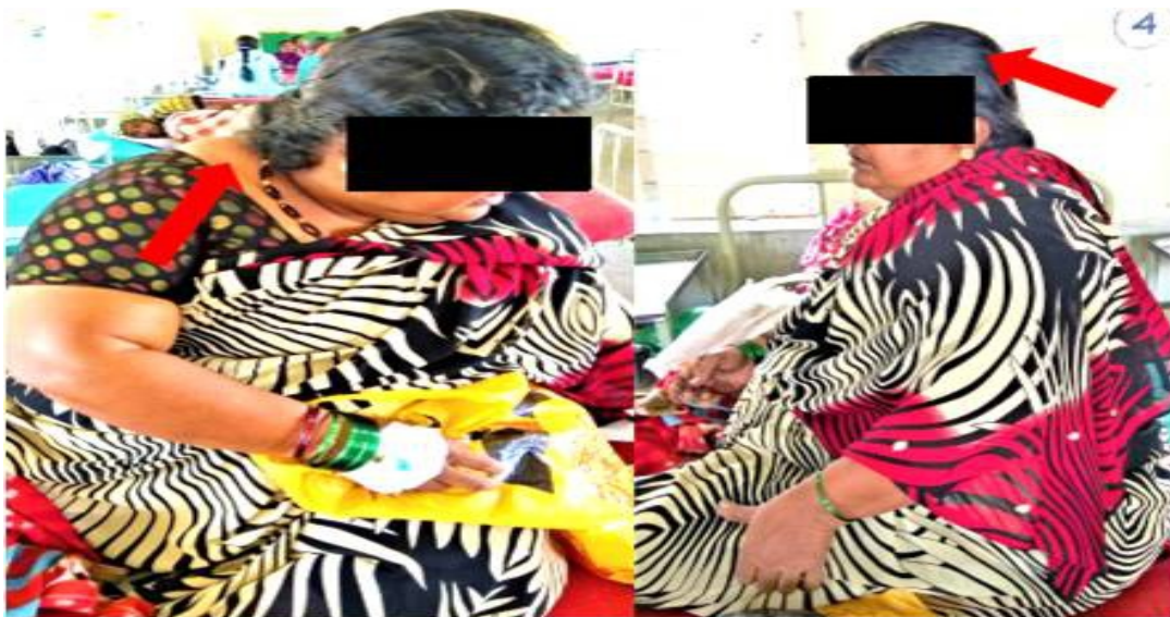
Figure 3: Striae and thinning of hair

No other significant past medical history or drug allergies. No focal deficits were identified on neurological examination. The patient was admitted to hospital with a presumptive diagnosis of drug-induced or Corticosteroid Induced Cushing's syndrome.