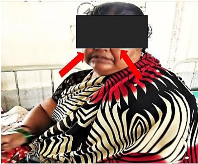
Figure 1: Moon Face in Cushing's syndrome

(Figure 3) and a heart rate of 96 beats/minute, respiratory rate of 22cpm and blood pressure of 170/100mmHg. The patient was conscious, well-oriented and appeared uncomfortable but not in distress. The laboratory investigations are mentioned in Table 1.