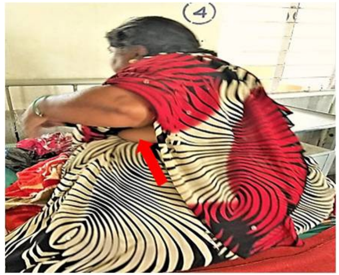
Figure 2: Abdominal distension and Obesity