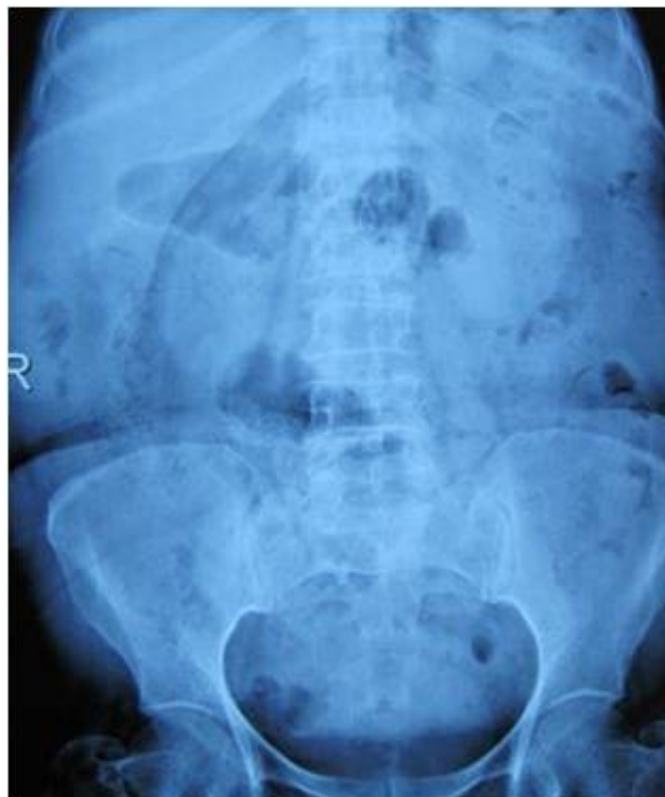
Figure 4: Radiograph of abdomen showing resolution of Intestinal obstruction