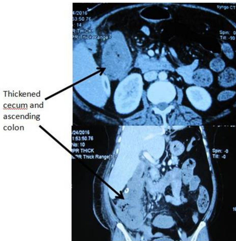
Figure 2: CECT abdomen with oral contrast showing circumferentially thickened Ascending colon with dilated small bowel loops