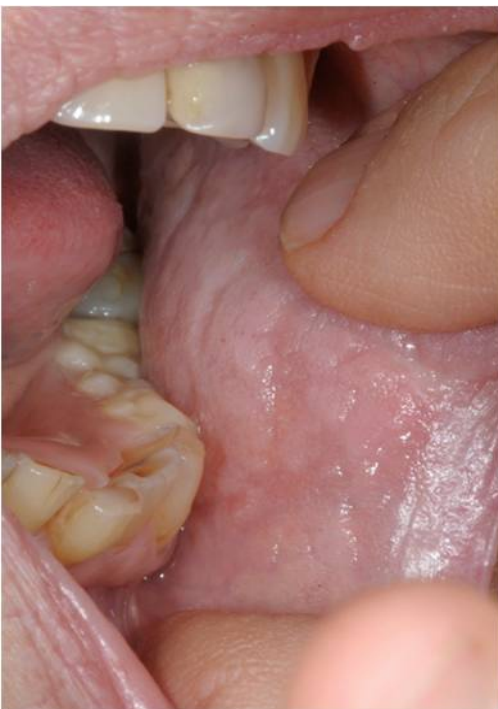
Figure 4(a): Buccal mucosa before chemotherapy.