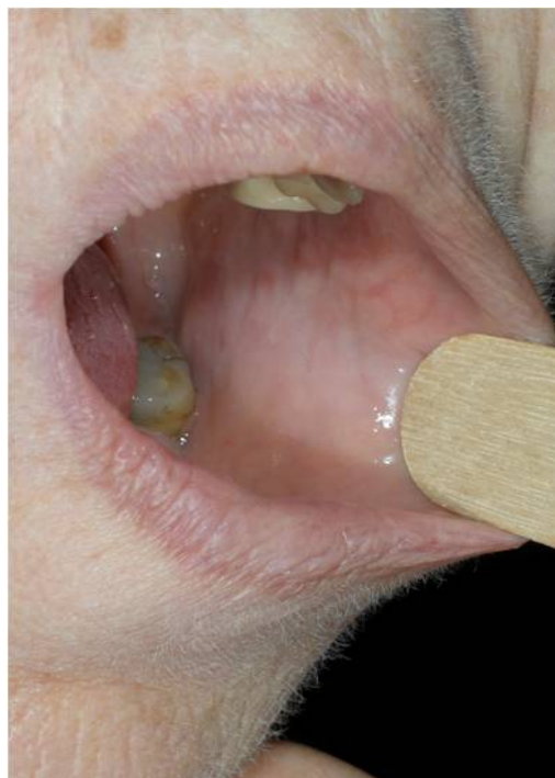
Figure 4(b): Buccal mucosa after completion of chemotherapy.