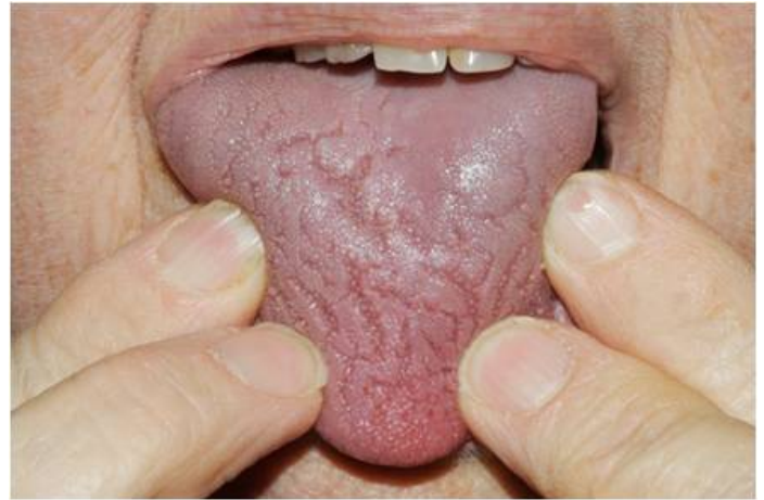
Figure 3(b): Tongue after completion of chemotherapy.