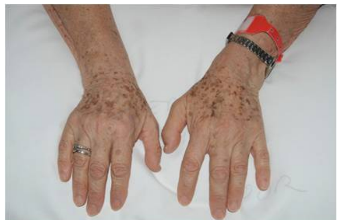
Figure 1(b): Seborrheic keratosis after completion of chemotherapy.