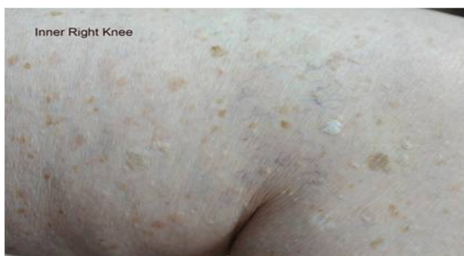
Figure 2(a): Right medial knee before chemotherapy.