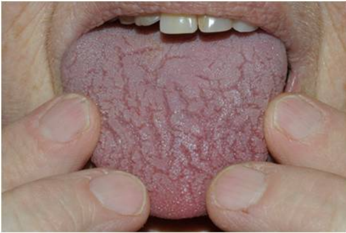
Figure 3(a): Tongue before chemotherapy.