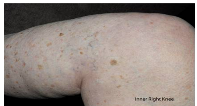
Figure 2(b): Right medial knee after completion of chemotherapy.