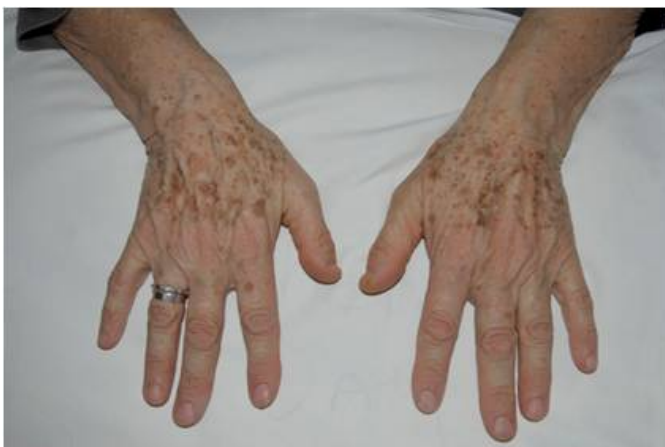
Figure 1(a): Seborrheic keratosis before chemotherapy.