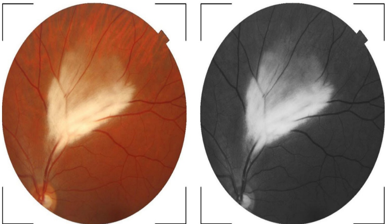
Figure 1: Fundus photography and red free picture of the left eye