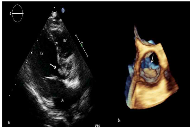
Figure 1. (a) Transthoracic parasternal long axis view showing an endocarditic mass (arrow) adherent on the ventricle side of the aortic cusp. LA: left atrium; LV: left ventricle; RV: right ventricle (b) Three-dimensional transesophageal echocardiogram (aortic view) showing the infectious mass adherent to the ventricular side of the right-coronary cusp and prolapsing in the aortic lumen during systole.