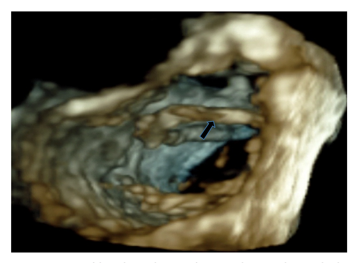
Figure 3: 3 D reconstruction of the right atrial aspect of inter atrial septum showing the thrombus (arrow) attached to it