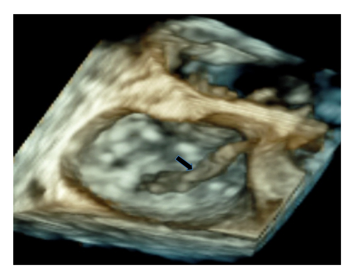
Figure 2: 3 D reconstruction image as seen from the superior aspect of the left atrium is shown. The thrombus is seen migrating across the interatrial septum through the PFO. Mitral valve is seen below